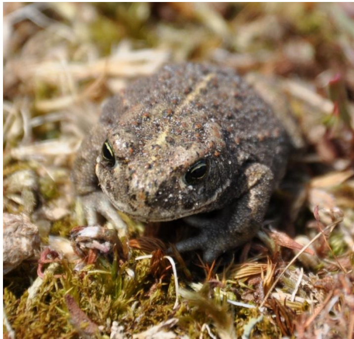
Natterjack Toad